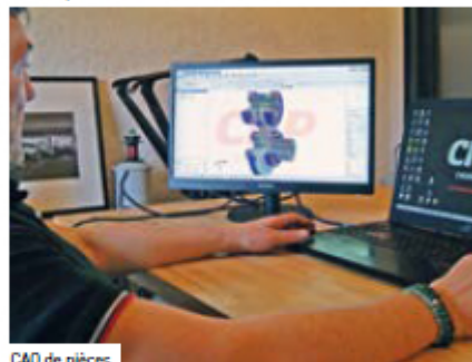
CAD de pièces