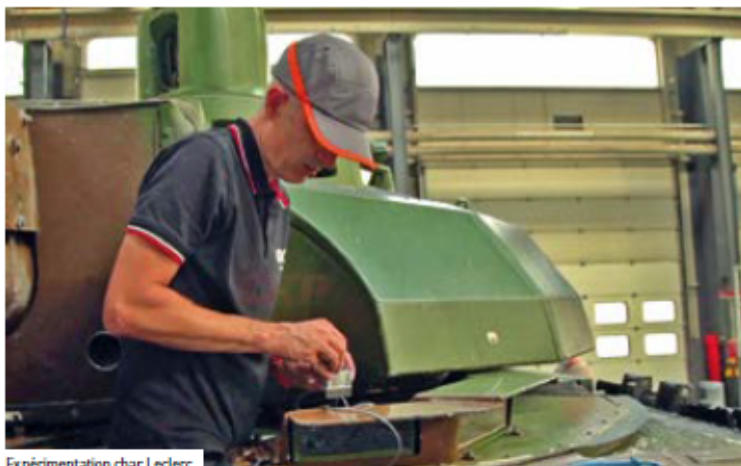
Expérimentation char Leclerc